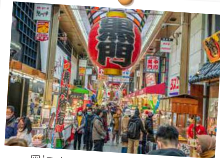
黑门市场 / Kuromon Market