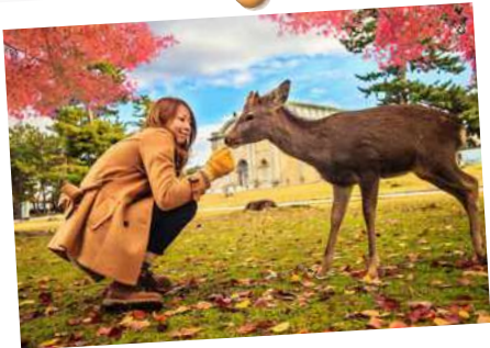
奈良公园 / Nara Park