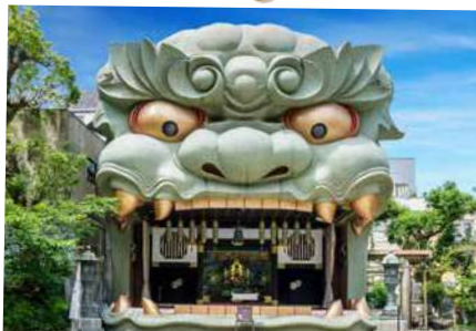
难波八坂神社 / Namba Yasaka Shrine