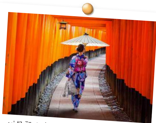
伏见稻荷神社 / Fushimi Inari Shrine